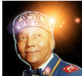
The Honorable Elijah Muhammad Messenger Of Allah

The white race of devils even trick the poor ignorant Black people to spy on the believers of Islam, to supply them with information of any successful progress for all Black people. They are referred to as stool pigeons, hypocrites, and Uncle Toms, due to their fear of the white race, who hire them to destroy themselves. This is a shame and disgrace that some of the ignorant, 99% of our people, who refuse our only